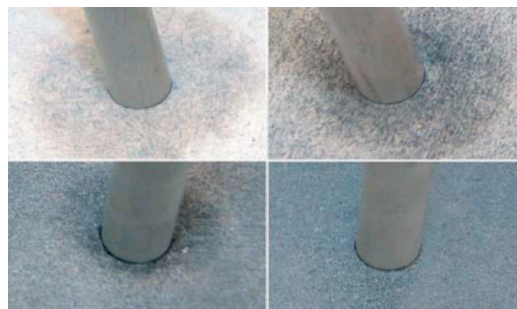
Oil traces on the surface after 144 h at room temperature

Typical applications of CALCAST CC 155 G4, G8, G16 are transfer- and transport-lauders, ladles, bushings, hot top rings, transition plates and many more.