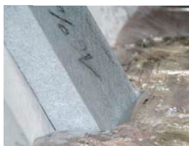
Wetting in liquid Aluminium